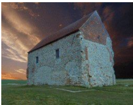
Chapel of St. Peter-on- the-Wall

The chapel was built in 654 AD by Cedd which he dedicated to St Peter. He came with a group of Christians, having been trained by Aidan at Lindisfarne in Northumbria. St Cedd who people think of today as the Saint of Essex was consecrated Bishop of the East Saxons in 654 and the Chapel became his Cathedral. It is the earliest Cathedral in the country of which so much remains today.