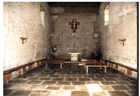
Inside – simplicity, beauty and peace

We also decided to go to Maldon where several Thames Barges are moored. This is a very picturesque town and well worth a visit with the barges moored alongside the quay.