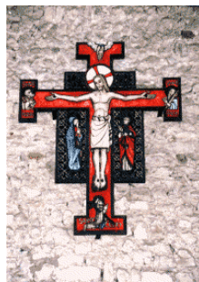
The cross depicting Christ & St Cedd