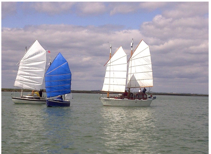
Ram II, Applecross and Dudifrent